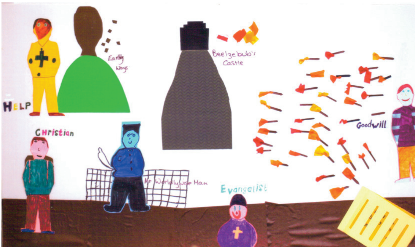
Example Craftwork from Week 2