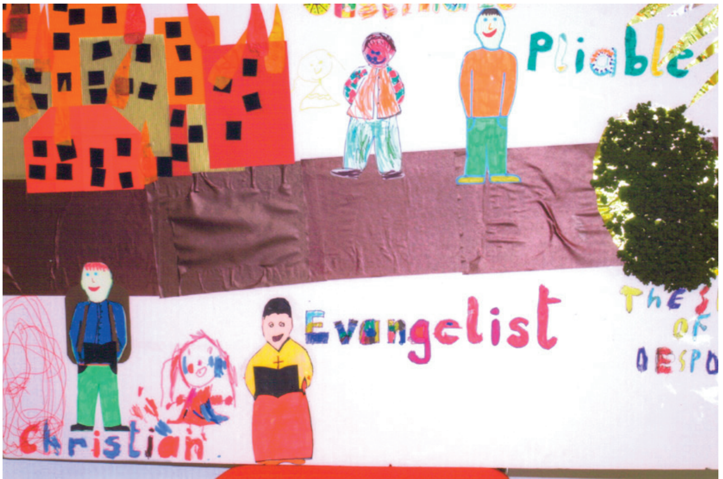
Example Craftwork from Week 1